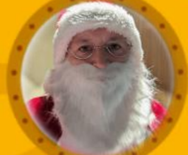
Santa Chief Fun Officer